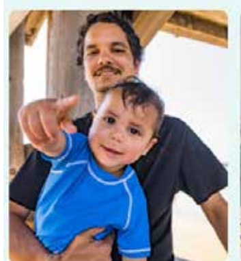
Families & Individuals

Next weekend, a special presenter from CatholicCare will be speaking at the 9am and 10.30am Mass to share insights into their mission and how we can all contribute to their compassionate work. We will learn more about the ways CatholicCare makes a difference in our community. There will be a leaving collection after Mass.