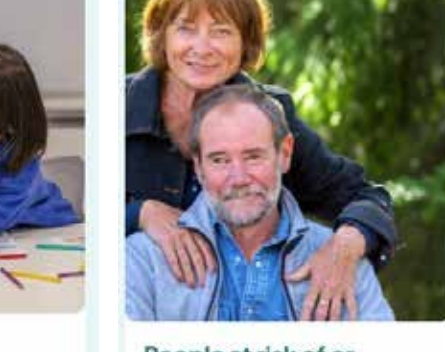
People at risk of or experiencing homelessness

We support young people, including teenagers and children to improve their mental health and wellbeing, develop their education, and work towards a brighter future.