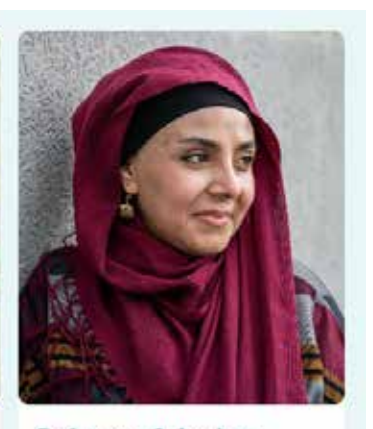
Refugees & Asylum Seekers

We support people of all ages and backgrounds, to find and maintain long-term, safe and affordable accommodation.